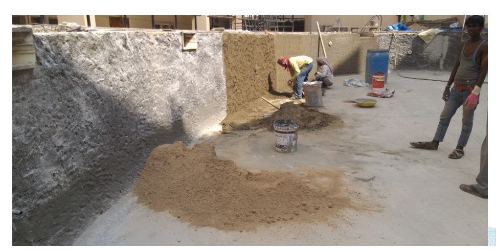
Floor & Wall Plastering