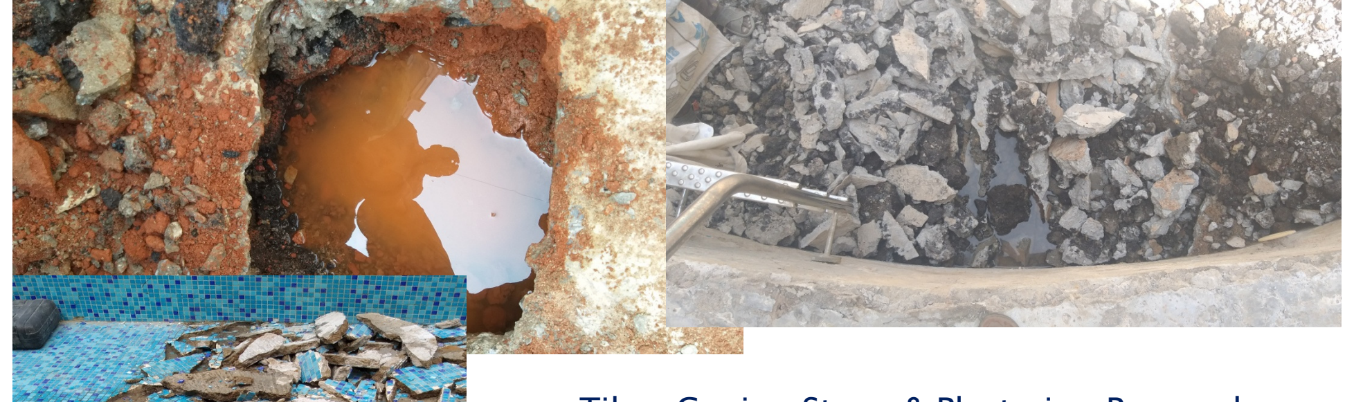
Tiles, Coping Stone & Plastering Removal