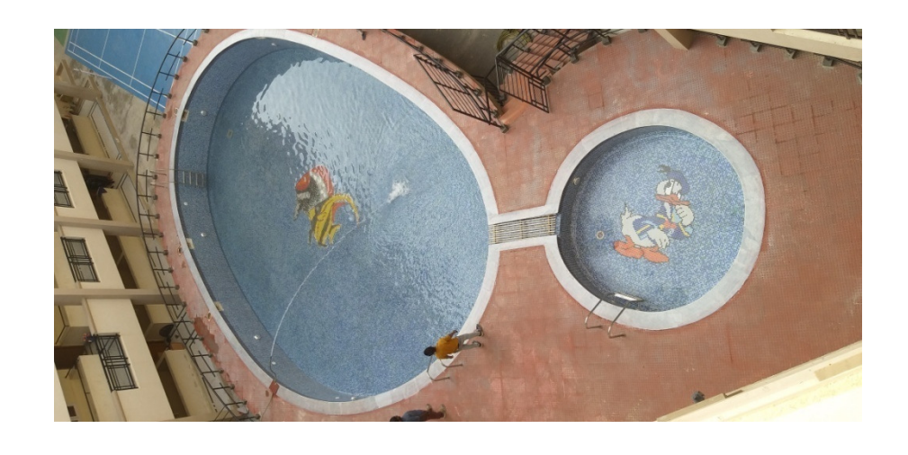
Filling Water To Pool