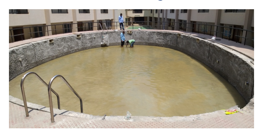
Water filled for Leakage Check