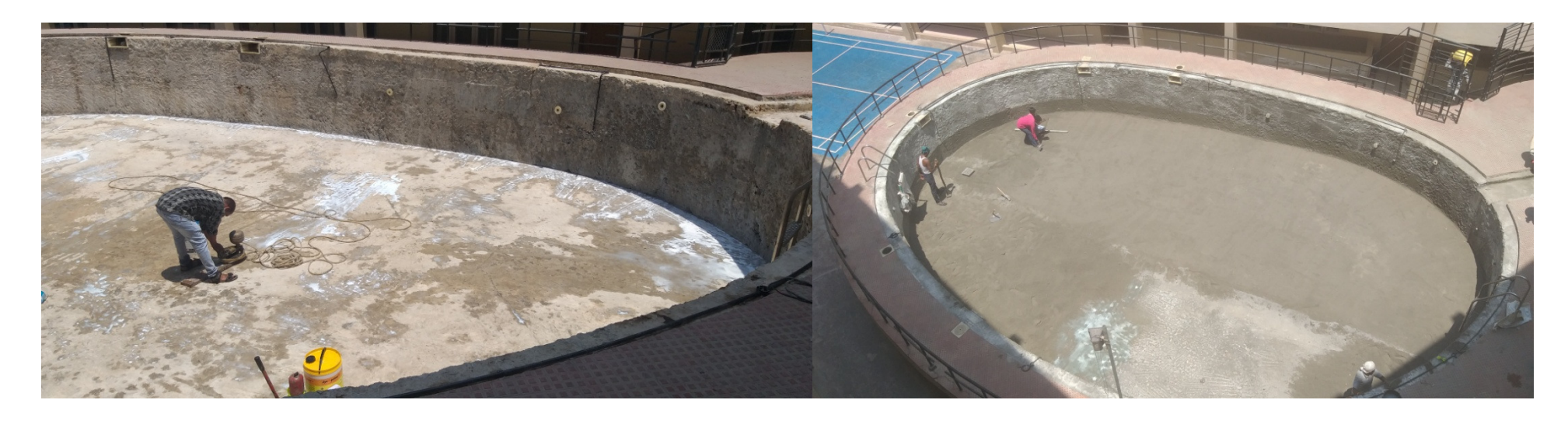
Multi-light Fly-Ash Concrete