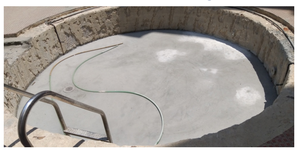
Floor Concrete & Grinding