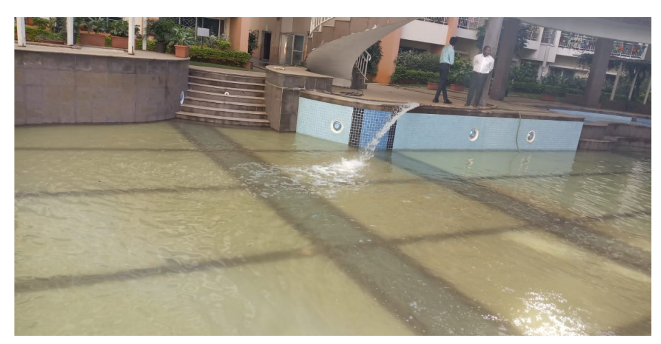
Fresh Water Filling Process

Beautiful View of Main & Kids Pool after Renovation work